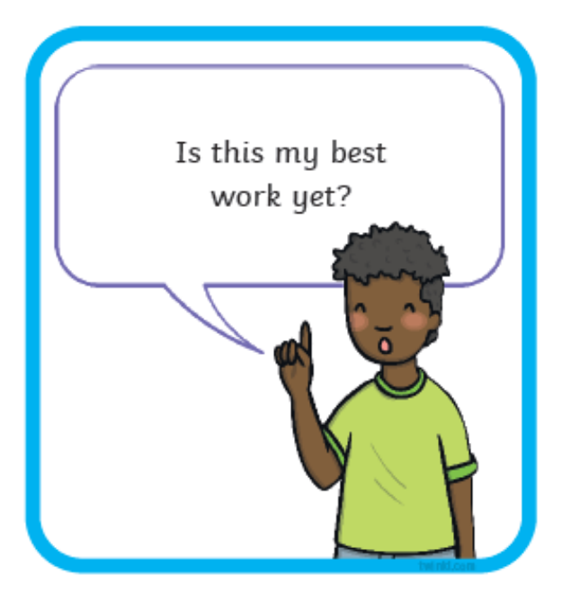
This resource is fully in line with the Learning Outcomes and Core Themes outlined in the PSHE Association <u>Programme of Study</u>.