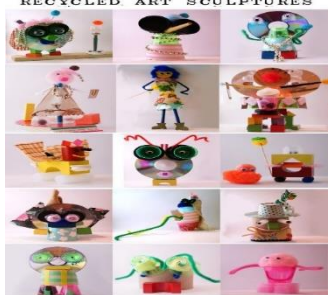
Loo Roll Art Challenge!

Visit the year 5 creative ideas for more ideas you can do with a toilet roll.