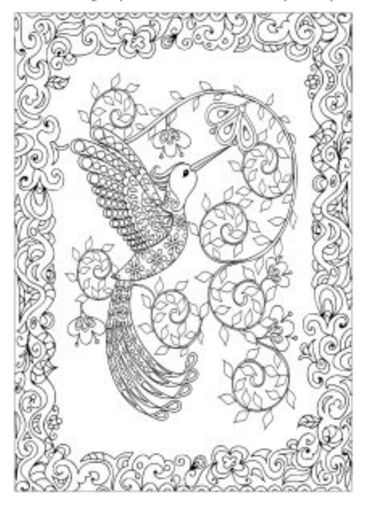
Have fun colouring this picture of our beautiful world. Can you draw your own?