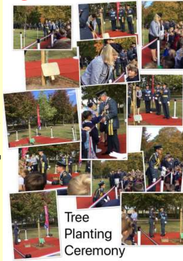
Tree Planting Ceremony