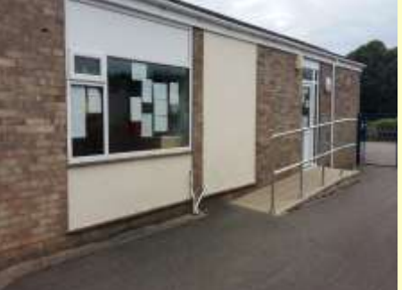
Before and After School Entrance